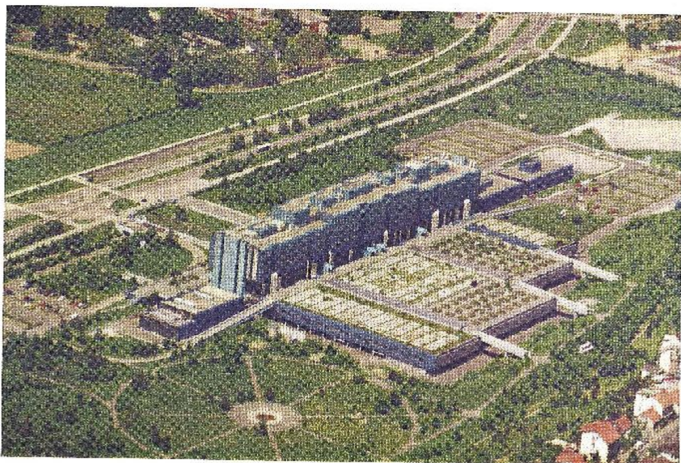
"Dubrava" University Hospital, Zagreb